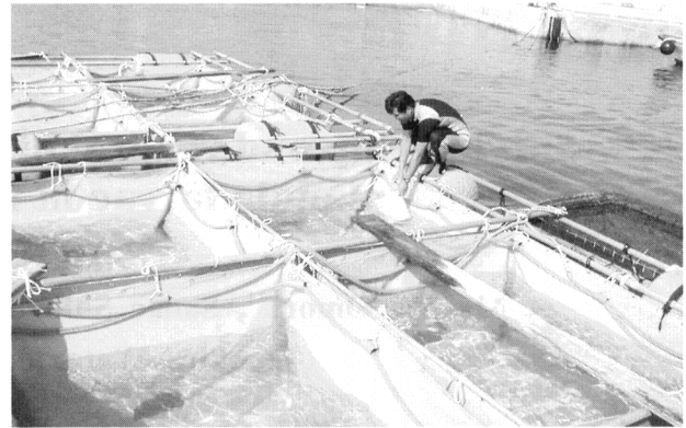
Fig. 1. Floating rearing pond

Experiments were carried out during the periods from May 23 to 29, and June 13 to 17, 2003, and from June 1 to 9, 2004, when slicks appeared on the sea surface at Aka Port or neighboring waters after simultaneous spawning at night